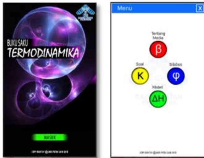
Figure 2 Thermodynamics digital pocket

Table 1 can be seen that the use of digital pocketbooks is effectively used in expert physics learning to make it easier for students to understand concepts. The use of digital pocket books makes participants feel happy and not bored following physics learning. The use of digital pocketbooks can improve cognitive outcomes and can improve learners' critical thinking skills. In addition, the use of digital pocket books is suitable for use in physics learning so that it can improve students' science literacy skills. The use of digital pocket books in physics learning is said to be more practical because it can be used anywhere and anytime.